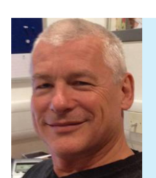
Head of Reproductive and Developmental Biology