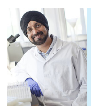
Head of Diabetes, Endocrinology & Metabolism