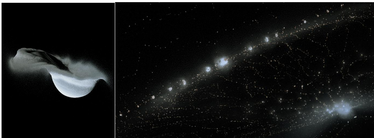
Fig. 1: Two snapshots from an SPH simulation of a collision between two icy moons [3], scattering ice and rock debris that could evolve into the rings and disrupt, re-form, and eventually crater the moons.

The young age of Saturn’s rings is implied by the combination of three key observations from the Cassini mission [1]: their low mass; the very low fraction of non-icy “polluting” material; and the incoming flux of micrometeoroids. These micrometeoroids bombard ring particles, eroding and polluting them [7]. However, the details of this process are poorly understood, and the efficiency of erosion and darkening with non-ice material has not yet been determined. Furthermore, direct experiments are unfeasible because of the very high speeds (~30–70 km/s)