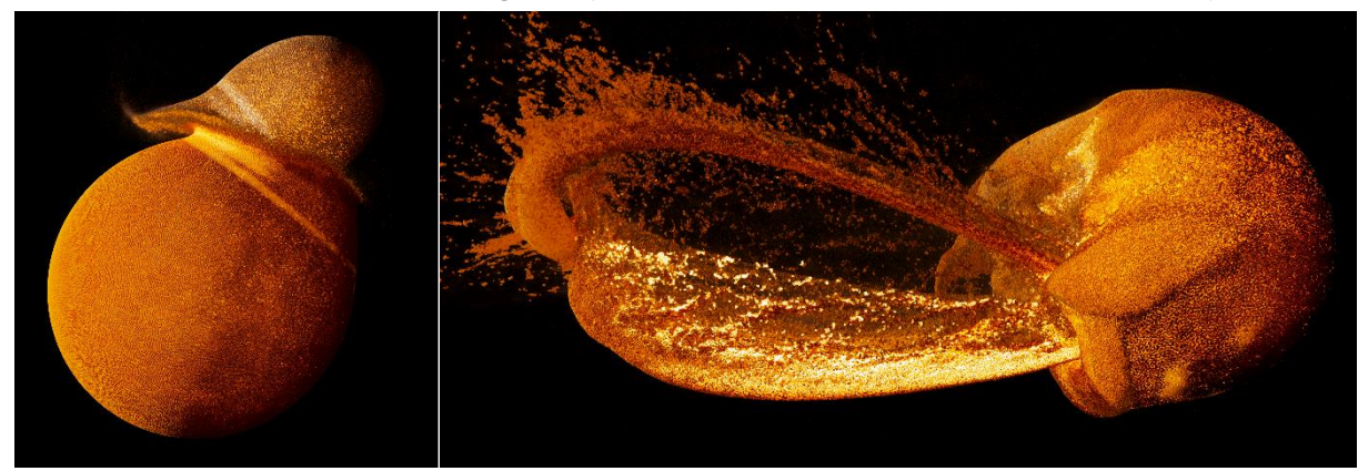
Fig. 1 : Two snapshots from a high-resolution SPH simulation that opened up new options for the Moonforming impact [3]. The impactor's core is also drawn into a long stream that falls into Earth's mantle.

Given the many open questions that could be explored around these impactful topics, the candidate will be free and encouraged to pursue new directions with their research beyond